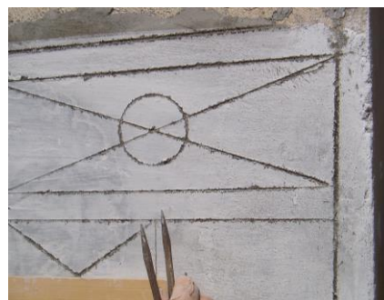
Figure 5. A craftsman designing a rectangle.

In summary, students studied the pictures of house surfaces and of craftsmen’s constructions, and searched for mathematical notions, as well as the type of their construction. They then followed the guidelines provided and completed the project by organizing a roundtable TV show.