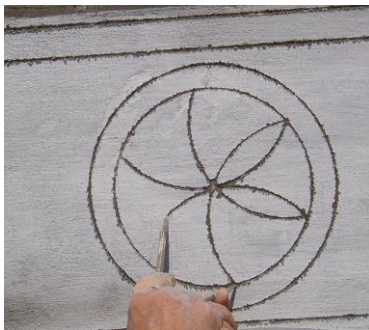
Figure 4. A craftsman designing circularly shaped patterns.

Furthermore, some pictures of craftsmen at the time they were working on ‘xysta’ were provided to the students as additional material. Here are samples of these pictures.