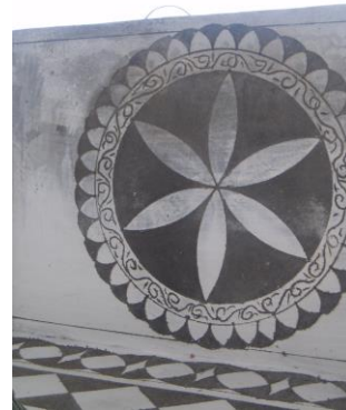
Figure 3. A circular design from a house façade.

Furthermore, some pictures of craftsmen at the time they were working on ‘xysta’ were provided to the students as additional material. Here are samples of these pictures.