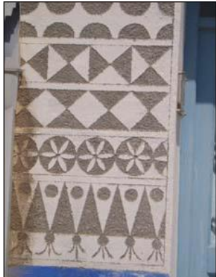
Figure 2. A design with symmetry and patterns from a house façade.