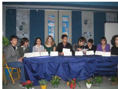
Figure 7. The panel.

Students further identified several kinds of symmetry that appear in ‘xysta’—from photos of houses and from craftsmen’s constructions. They noticed that craftsmen constructed, in their own apprenticed methods, parallel lines, rectangles, rhombi, squares; they found the center of a rectangle; and they divided a circle into six equal parts, leading to the creation of a regular hexagon.