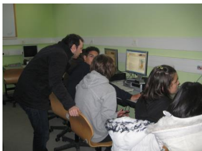
Figure 6. Working through WebQuest.