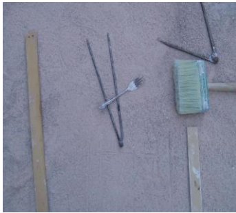
Figure 1. Tools: a lath, a compass, a divider.

Xysta craftsmen use particular tools: a lath (straight edge); a compass with two identical points; and a fork for scratching some areas of the figures so that one shape becomes dark (the scratched one), and the other white.