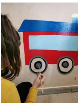
Understanding that the wheels of the train need space

mathematical process involved in the algorithm that measures the cycle's perimeter, we take advantage of Irene's talent in designing